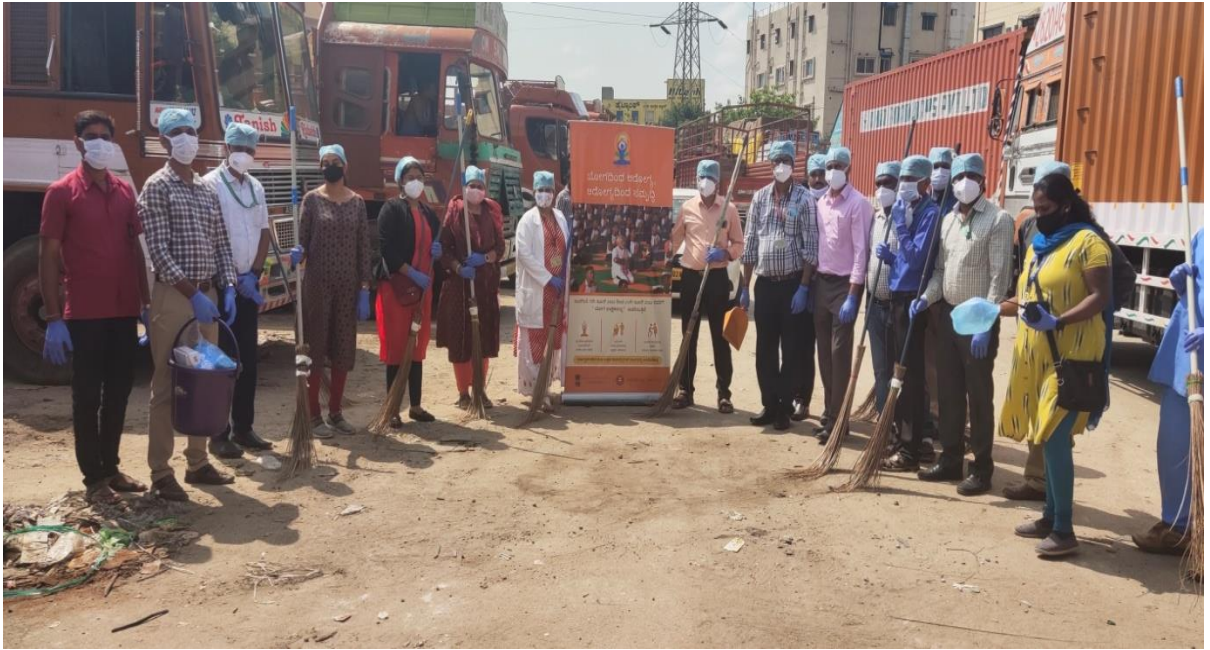
Team of Staff for Cleaning Basti