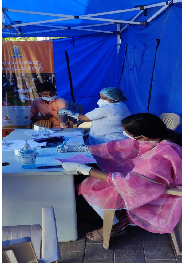
Health Camp at ESIC Hospital, Peenya,Bengaluru